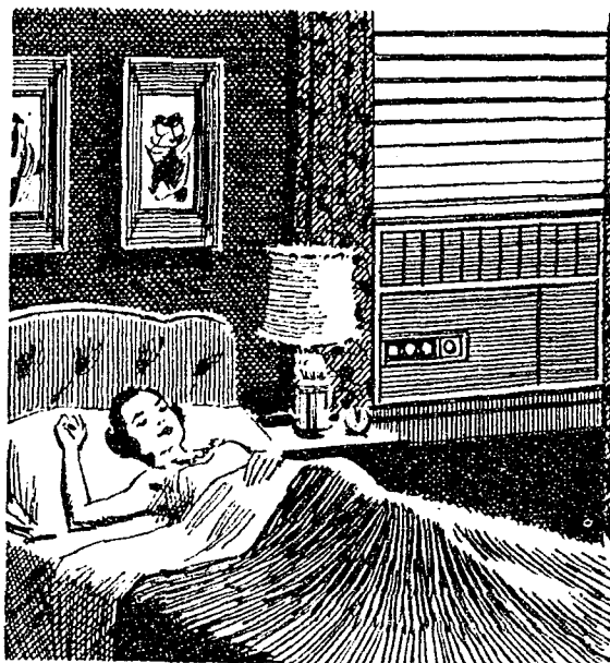
A room air conditioner lets you sleep cool as a mountain stream—even under a light blanket!

Electricity gives you a vacation all summer!