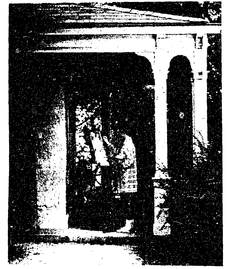
ABSTRACT AT ELM COTTAGE-Marianne Levenoski works on her abstract picture on the porch of the cottage which will be used the year round as a kind of annex to the art students regular habitat-Temporary Building.