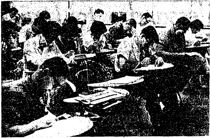
PUSH THAT PENCIL —Midterm exams have started already for intercession courses and many students are busy filling those old familiar bluebooks again.