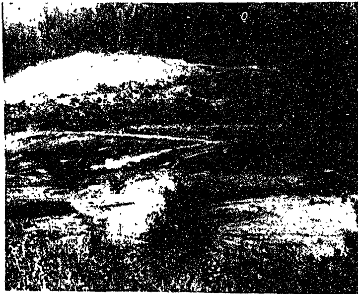
DIG MAN, DIG—Stone Valley Dam Project received about $60,000 from the Penn State Alumni Fund. The project will be partially completed by late Spring.