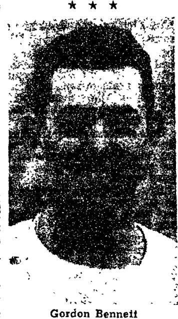
. . . Lion's top scorer

TIRED??? Let Collegian Classifieds WORK FOR YOU