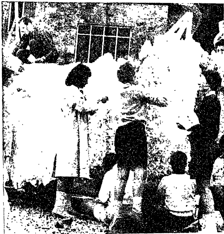
AS THE HOUR DRAWS NEAR the pressure increases. Members of Zeta Tau Alpha and Tau Kappa Epsilon busily prepare their float for tonight's parade.

He-Man finals will consist of the broad jump, shot put and bench press.