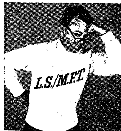
Dr. Frood, Ph.T.T.

Dear Married Student: You should notify the police. Someone has obviously been there.