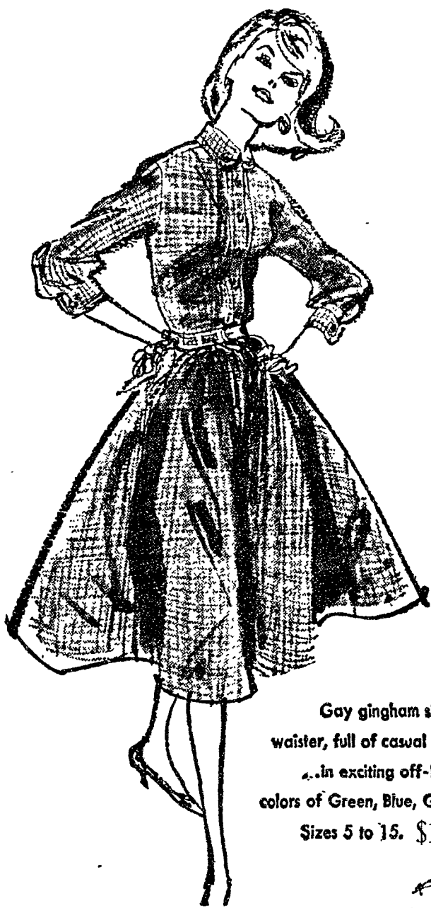
Gay gingham shirt-waister, full of casual flair . . . in exciting off-beat colors of Green, Blue, Gold. Sizes 5 to 15. $12.95

Product of The American Tobacco Company "Tobacco is our middle name" © A. T. Co.