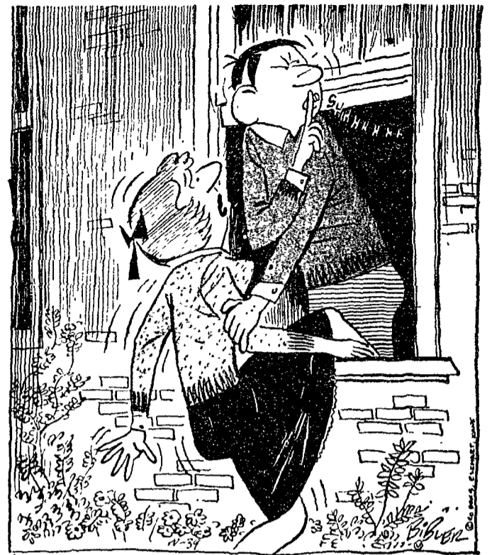
"BUT WHEN I SAID YOU COULD TAKE ME HOME AFTER THE DANCE—I THOUGHT YOU MEANT MY—"