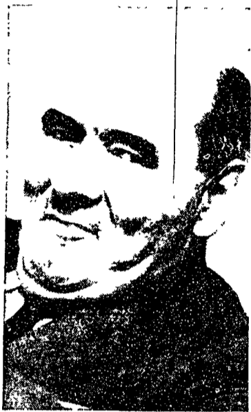
C. Northcote Parkinson

According to Parkinson, the idea of his now-famous "law" came to him while serving as a major in the British Army during World War II. The discovery