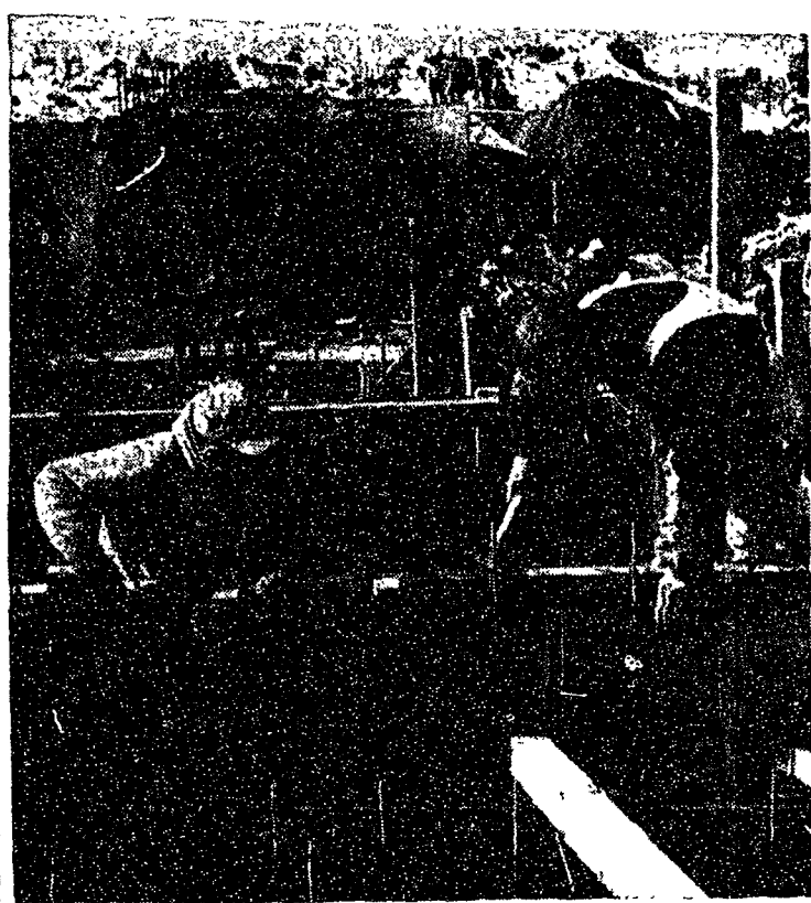
CONSTRUCTION CONTINUES —Collegian Photo by Charles Jacques throughout the winter. These men are putting up forms before they pour concrete for the basement walls in the Turf Plot residence halls.

The Modern Dance Club is the interest group which functions along with the dance department. The club's main project is its dance concert, which will be presented during Mothers' Day, weekend May 5 and 7.