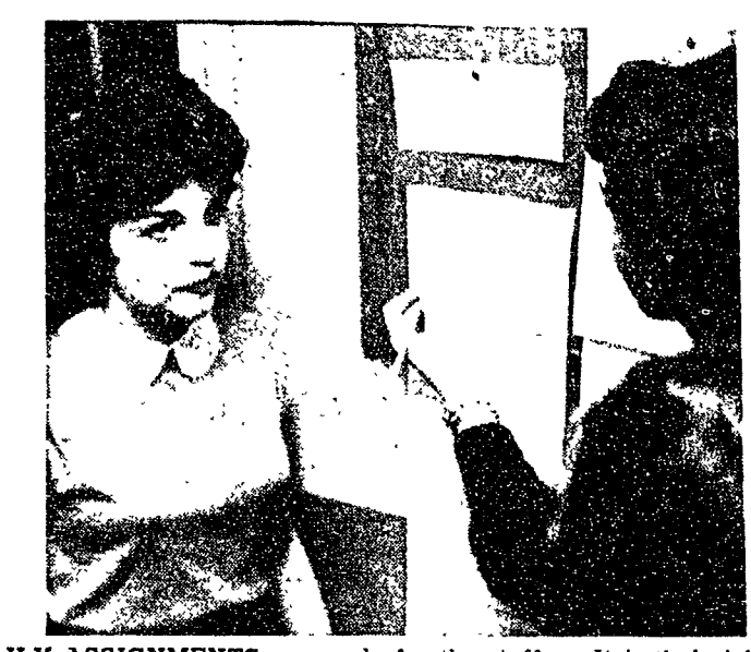
DAILY ASSIGNMENTS are made for the staffers. It is their job to check and initial the assignment sheet—and then get the story.

Hundreds of stories filter through the Collegian office daily as staffers do their part in helping the student body keep informed