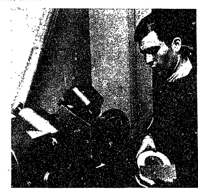
PHOTOGRAPHS ARE PART OF THE paper too (as can be seen by this page.) They are checked by Photography Editor Marty Scherr and then engraved on the machine seen here, the Fairchild Scan-a-Graver.