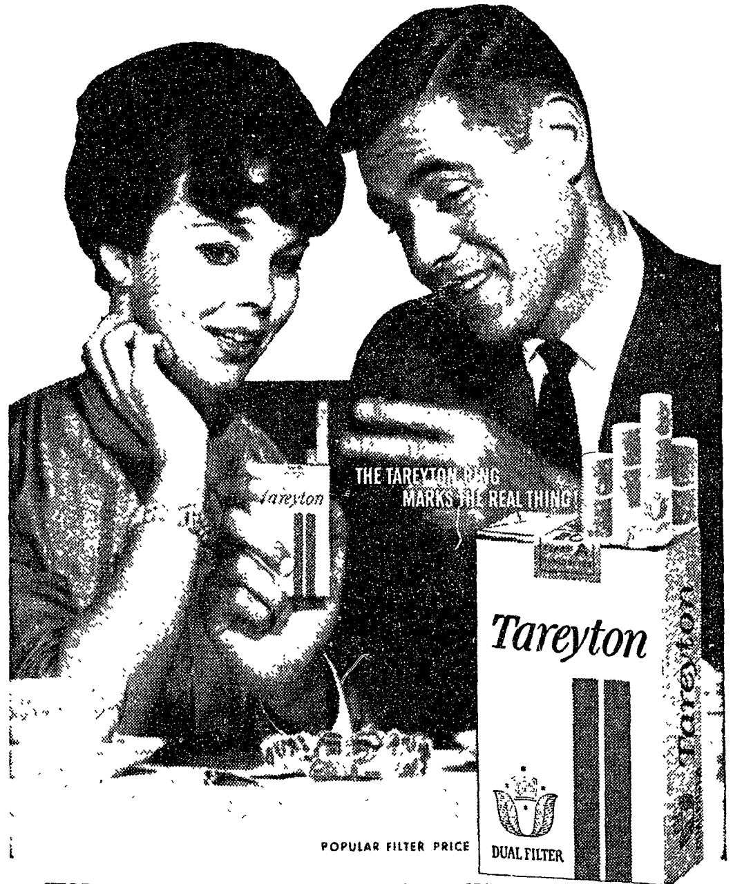
POPULAR FILTER PRICE