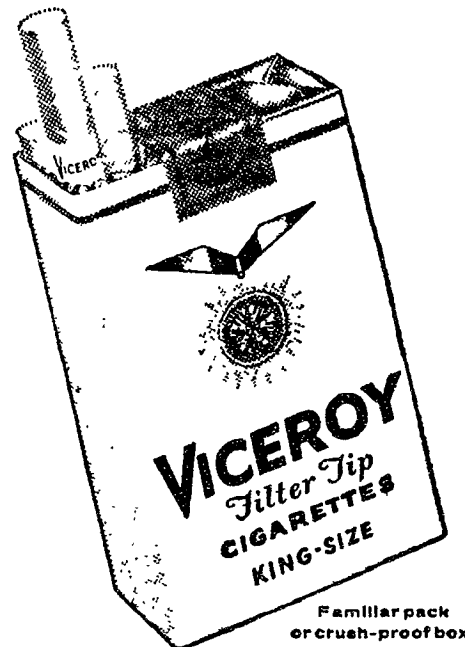
Familiar pack or crush-proof box.

*If you have checked (C) in three out of four questions, you're pretty sharp . . . but if you picked (B), you think for yourself!