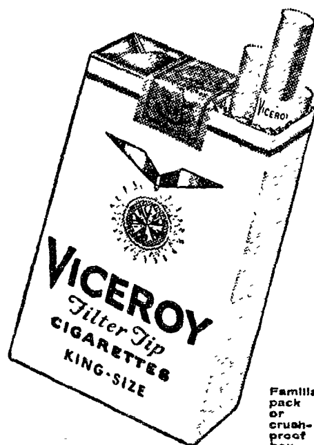
Familiar pack or crush-proof box.

When you depend on judgment, not chance, in your choice of cigarettes, you're apt to be a Viceroy smoker. You