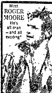
Meet ROGER MOORE He's all man - and all exciting!

Remember where you came from gypsy. Remember your faith. Remember the way back to the convent! The strange story of Teresa—who remembered the way back!