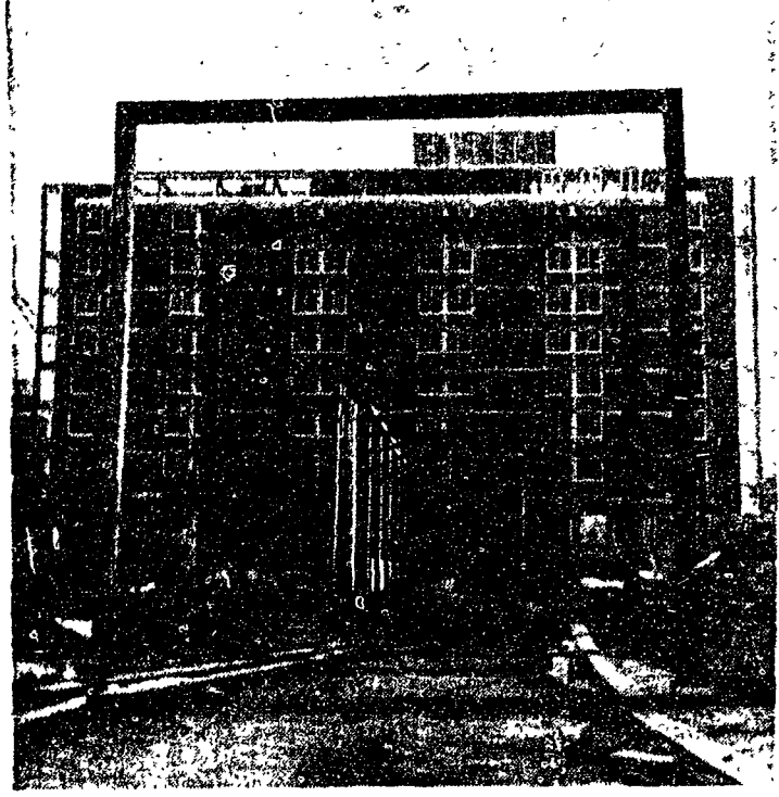
THE RISING CITY—in the center of campus, the Pollock Circle Project, will be ready for occupancy in the fall of 1960. The new halls will house 2016 students, 992 of which will be men.