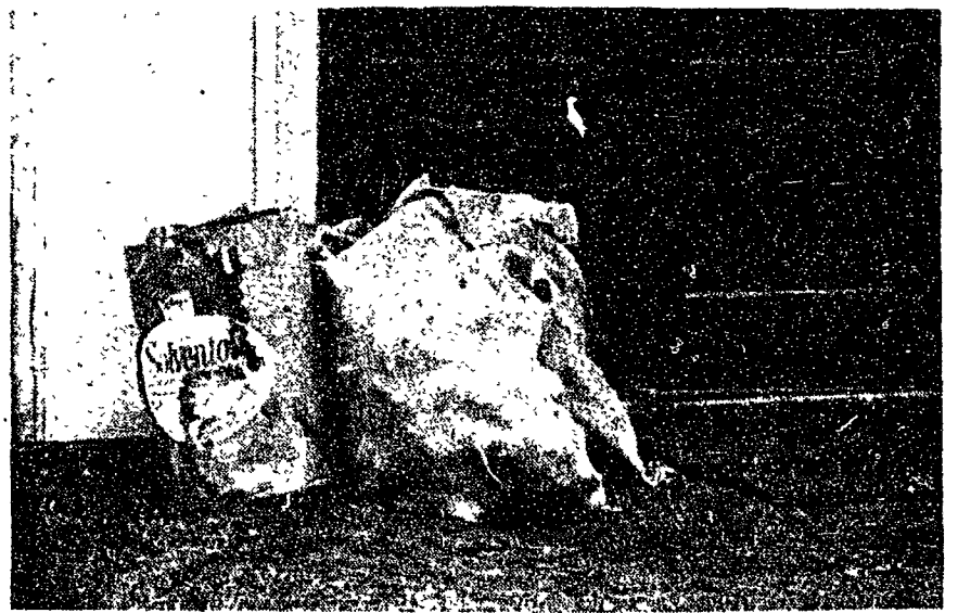
SEVERAL TIMES A week these garbage bags adorn the front of the Nittany halls. Collections are made regularly but the bags wait outside.