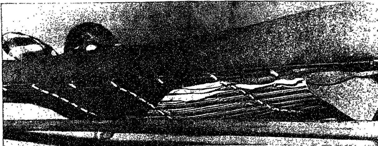
THE DOUBLE DECK bunk beds may scare the "uninitiated", but these men are used to the 6 to 8 inch sag in the top beds. This is not a trick of perspective, but was taken level with the bed.