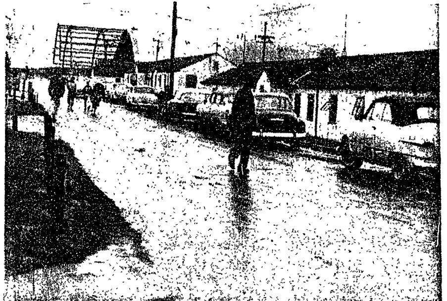
WHY DO Nittany men walk in the street?? Because they have no sidewalks.