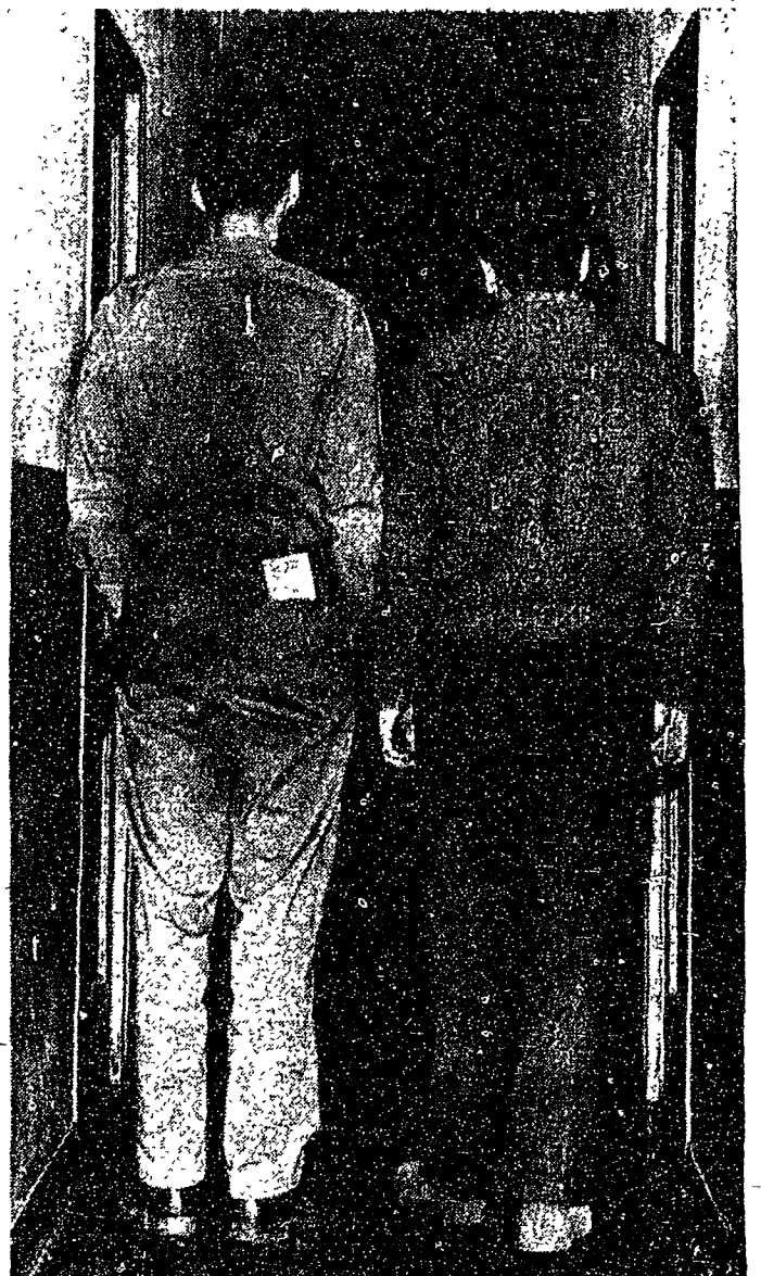
THESE TWO MEN , both average size, have trouble walking down the hall side by side.