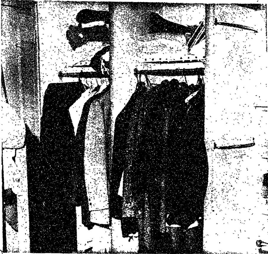
CLOSET SPACE is at a premium in the Nittany Residence halls. Crowded in the open closets are about half of the belongings of two students . . .