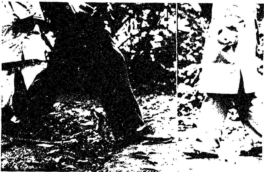
"YOU OUGHTA SEE IT WHEN IT REALLY RAINS"—The Nittany area becomes a veritable mud hole after a rain. These feet are some of the puddle jumpers that have to slosh their way to class. An improvement program is being planned by administration members.