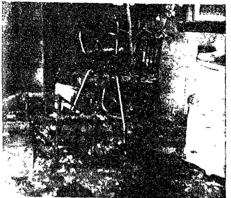
A FIRE WHICH DAMAGED the infirmary early Saturday morning left this debris. The physical therapy room and its contents, worth over $30,000, was completely ruined. (See story, page 1)