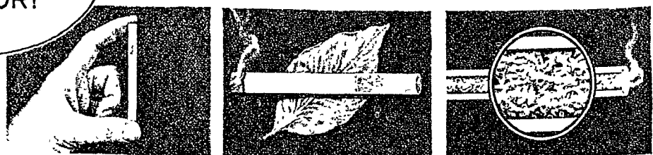
HERE'S WHY SMOKE "TRAVELED" THROUGH FINE TOBACCO TASTES BEST

See how Pall Mall's famous length of fine, rich-tasting tobacco travels and gossamer the smoke—makes it mild—but does not filter out that satisfying flavor!