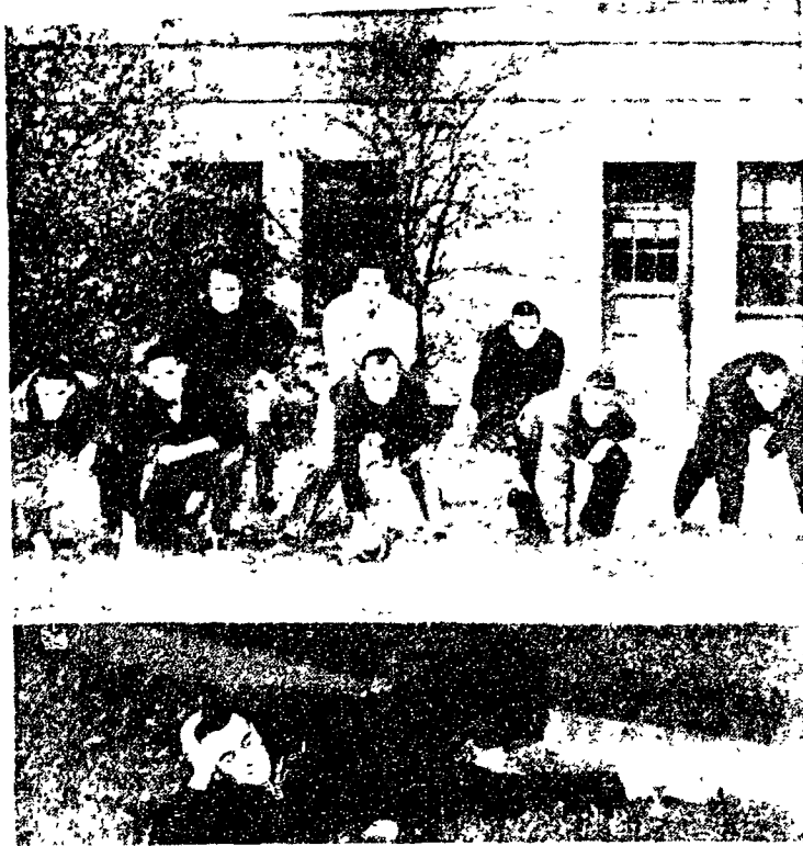
THEY'RE OUT FOR BLOOD —The stalwart aggressive Collegian Pio (for probation) grid squad menaces its contempt for the Pitt News Kittens whom they meet in the 2nd annual Blood Bowl tomorrow in Forbes Field in Pittsburgh. The inset shows the "lonesome end" (an identical twin of the left end) taking his position for the Pros' best play—the "sleeper." (See page 7 for story.)