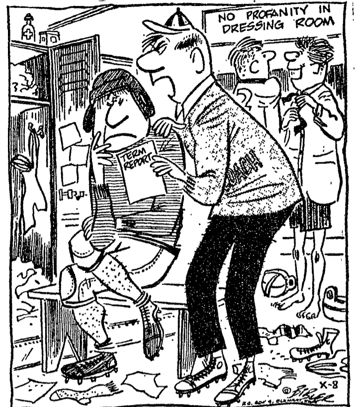
"DON'T DESTROY YOUR WHOLE FUTURE!! YOU MUST STUDY HARD RIGHT UP TO THE THANKSGIVING GAME!"