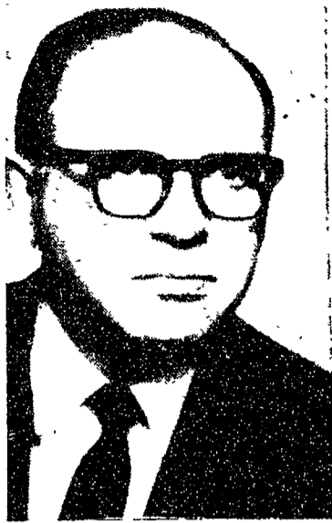
HUGO WEISGALL , composer and conductor who is now on the University faculty, will speak on 20th century opera tonight in the HUB assembly room. Weisgall is the first of four lecturers in the Open Lecture Series.

Before the theme of the program starts, the senior members of the Blue Band will be asked to step out and take a bow in recognition of their band work.