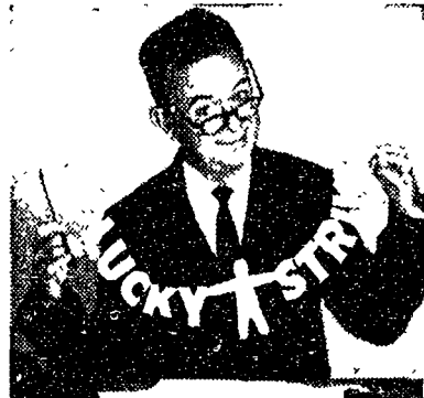
Dr. Frood, Ph.T.T.