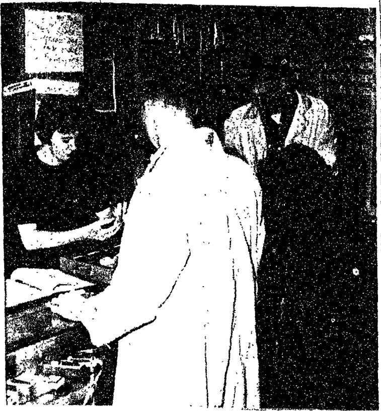
READY CASH is the motto of the Student Check Cashing Association. Students have made good use of this new service, cashing over $25,000 worth of checks in the three weeks it has been in oneration.