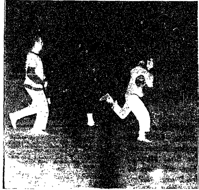
PHI KAPPA PSI BRUCE McKAY—takes the ball on a reverse run for a big gain in the Phi Psi-Omega Psi Phi intramural game last night. Phi Psi won the game by a 7-3 edge in first downs.