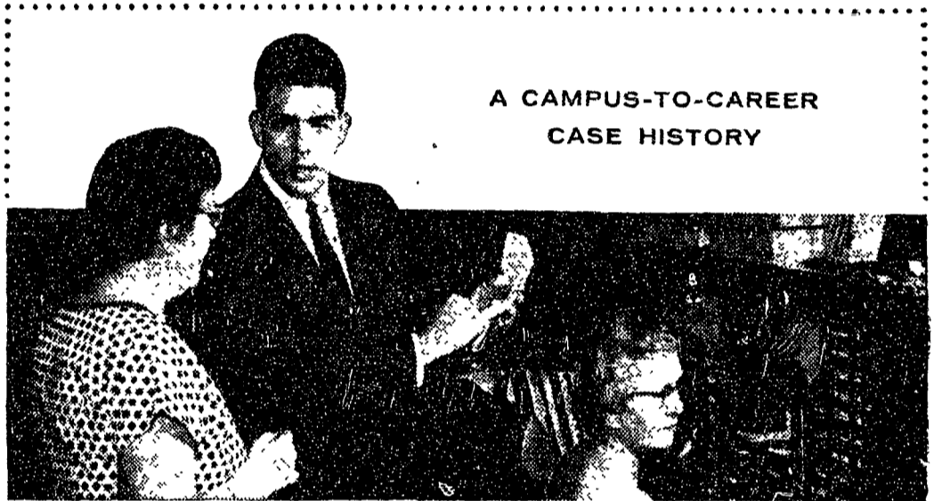
A CAMPUS-TO-CAREER CASE HISTORY