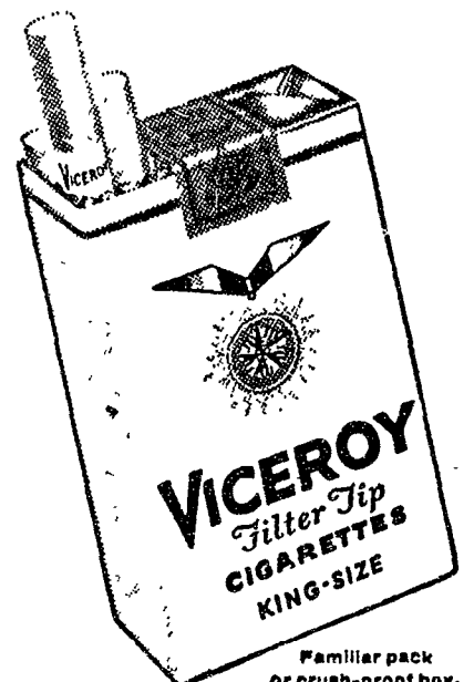
Familiar pack or crush-proof box.

*If you checked (B) in three out of four of these questions, you're a pretty smart cooky—but if you checked (C), you think for yourself!