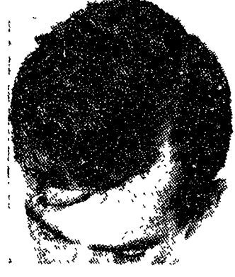
"Surface" Hair Tonics