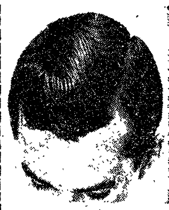
Penetrating Wildroot Cream-Oil

"Surface" hair tonics merely coat your hair. When they dry off, your hair dries out. But the exclusive Wildroot Cream-Oil formula penetrates your hair. Keeps hair groomed longer...makes hair feel stronger than hair groomed an ordinary way. There's no other hair tonic formula like it.