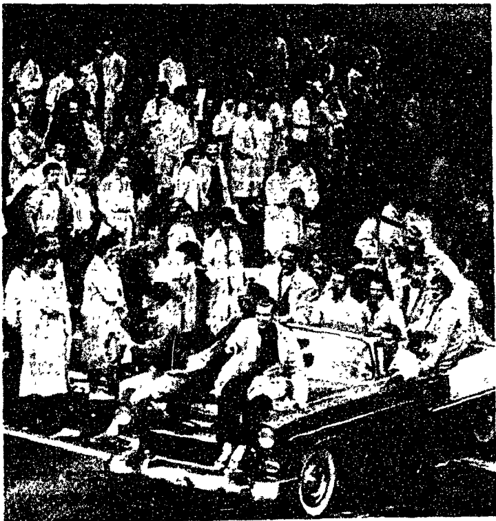
STATE COLLEGE IS THE ONLY TOWN that celebrates victories through toilet paper parades instead of ticker tape parades. The parade was part of the jubilation that pervaded State College after PSU beat Illinois 20-9 Saturday.