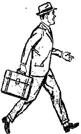
LIVE, WORK, AND PLAY IN NEW JERSEY

Here is your opportunity to learn about your future in a rapidly growing company which is a leader in one of today's most dynamic industries.