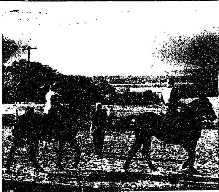
SLOW AND EASY —Captain Gregory A. Gagarin gives instructions to the entrants in the egg race during the Horse Show held Sunday at the University Stables. A total of 64 ribbons were awarded in the 12 events.

FOR GOOD RESULTS USE COLLEGIAN CLASSIFIEDS