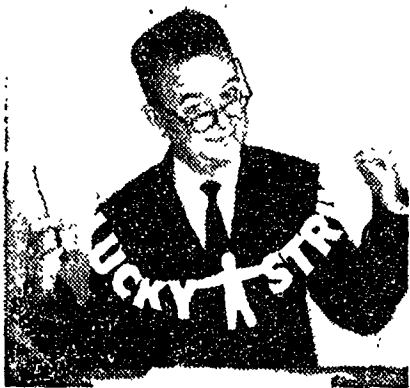
Dr. Frood, Ph.T.T.