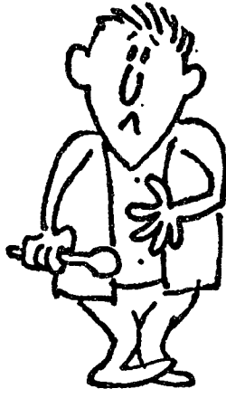
ALWAYS HUNGRY HAL: I'm a before-and-after-meal TANG man. It really fills in where fraternity food leaves off. Buy two jars. Your friends need vitamin C, too!