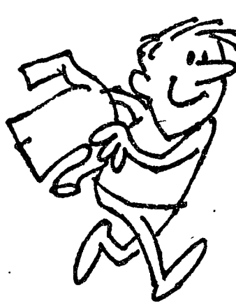
LAST MINUTE LOUIE: A fast TANG and I can make it through class... 'til I have time for breakfast. Fast? All you have to do is add to cold water and stir.