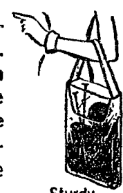
Sturdy, re-usable tote-bag

Each kit comes packed in a practical, reusable plastic tote-bag. Contains Bear Brand pure virgin wool yarn, trimming ribbon, bone rings for buttons and complete easy-to-follow instructions for knitting sizes 12 to 18. In your choice of beautiful colors and ribbons.