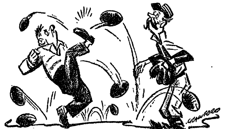
Mr. Doubleday had invented baseball the day before.....

Finally he went to Omaha where he got a job in a tannery beating pig hides until they were soft and supple (hog-flogger.) Here he found happiness at last.