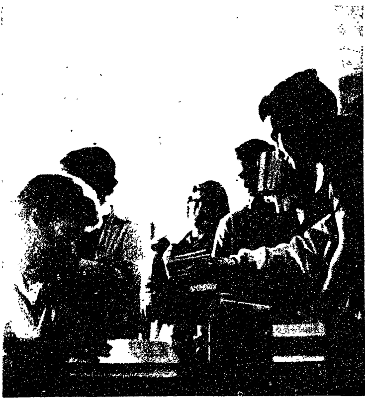
SORRY, THAT BOOK ISN'T USEABLE this year, they changed it again! This was a familiar comment to students as they tried to give their books to the UBA for re-sale. The UBA starts selling textbooks today.