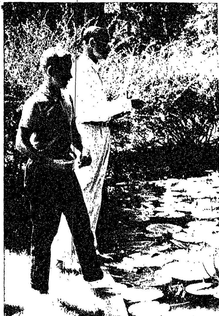
PREXY AND HIS SON throw food to hundreds of hungry goldfish in the pond in front of the President's home.