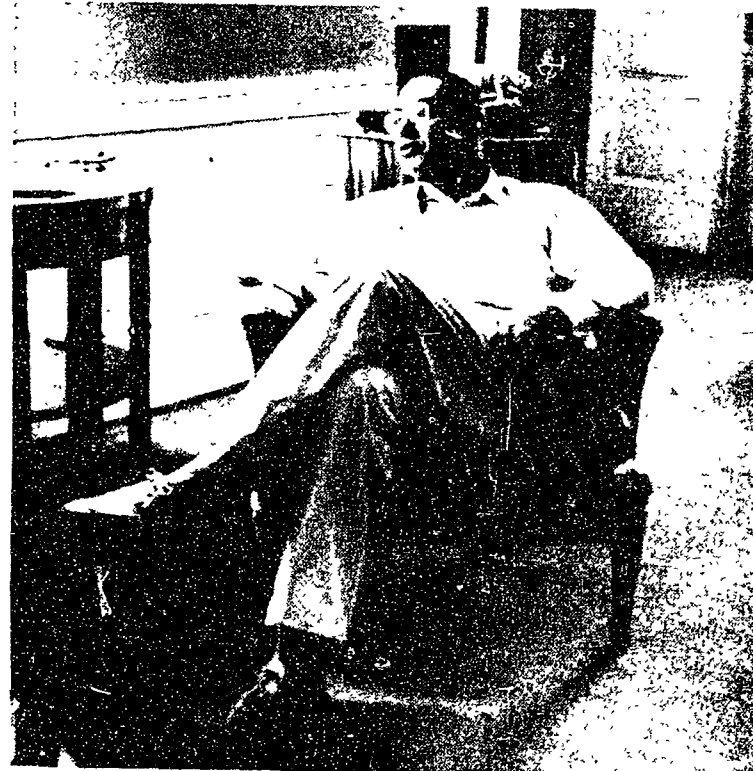
PREXY RELAXES after a long day of horseback riding, tennis, flying and golf. He leaves with his family for their summer home in Kitty Hawk, N.C., Saturday.