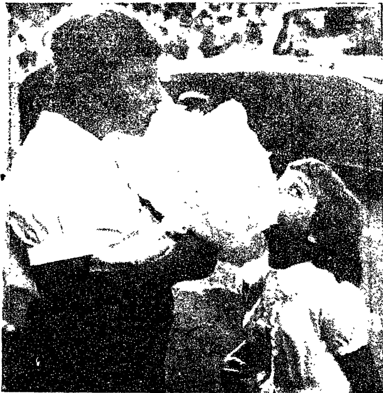
COTTON CANDY was a big favorite with the younger set at the 4th of July carnival in downtown State College. Bingo was almost as popular with the oldsters.