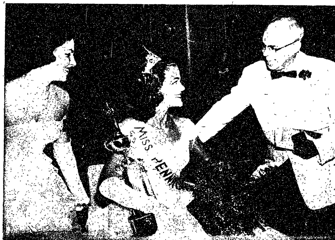
CONGRATULATIONS from One of the Judges.