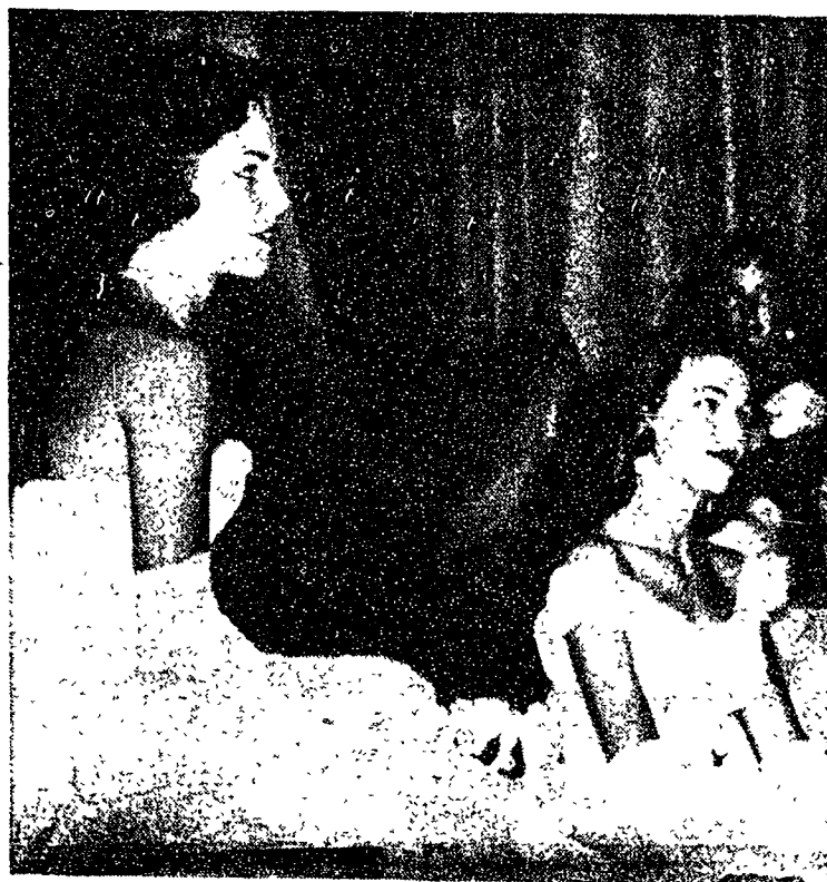
WAITING FOR the Judges' Decision