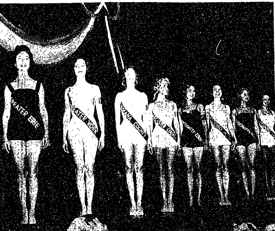
TEN SEMI-FINALISTS LINE-up in Swim Suits