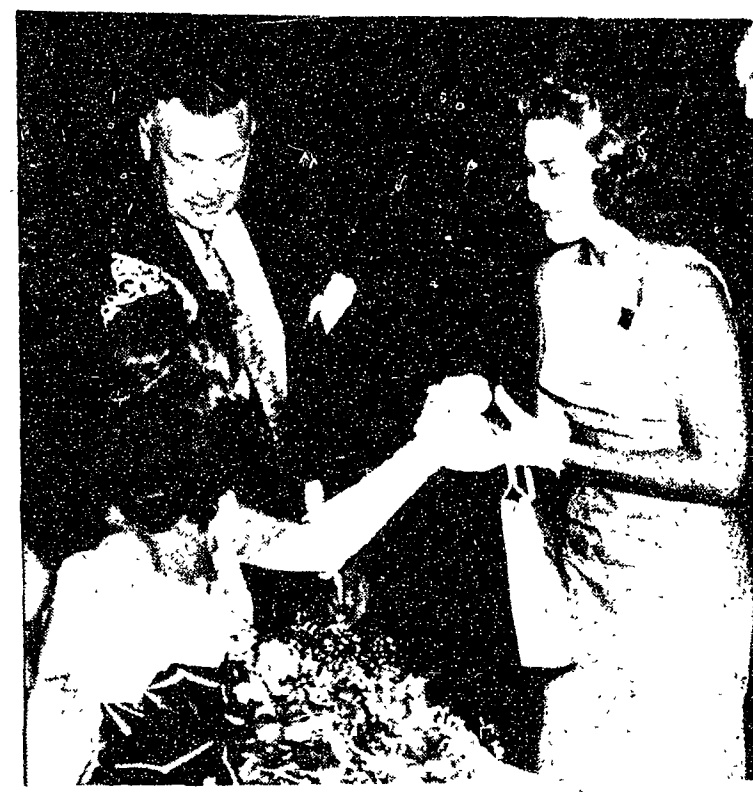
CONGRATULATIONS from the Family