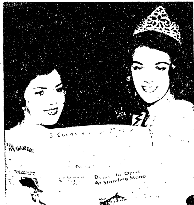
TIME OUT for a look at the Collegian