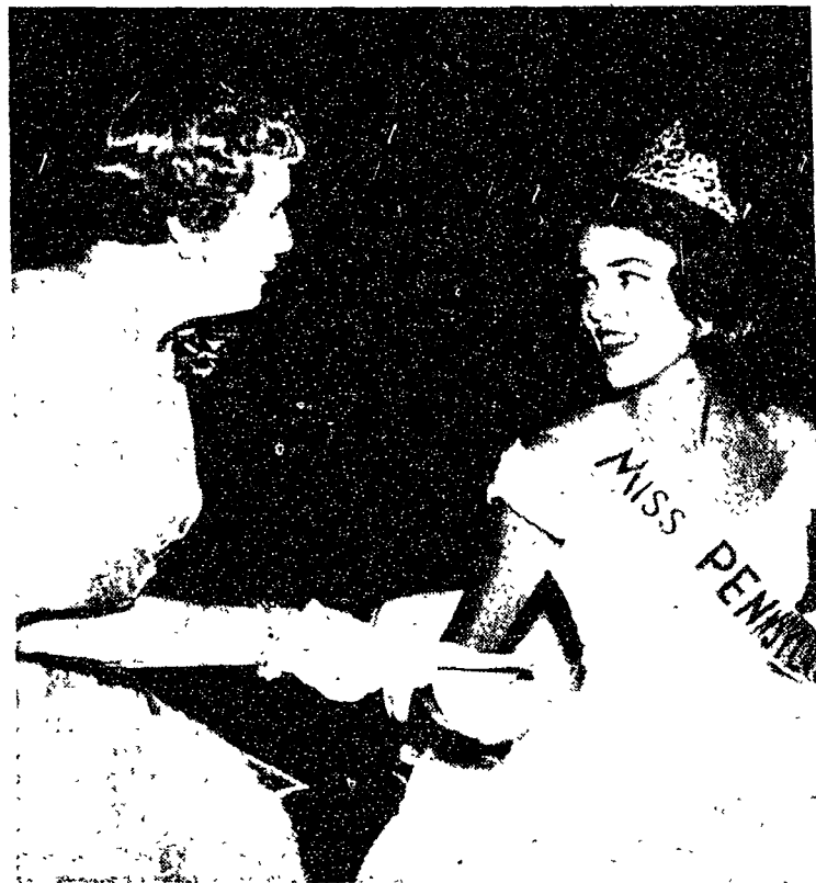
A SCHOLARSHIP from the Governor's Wife