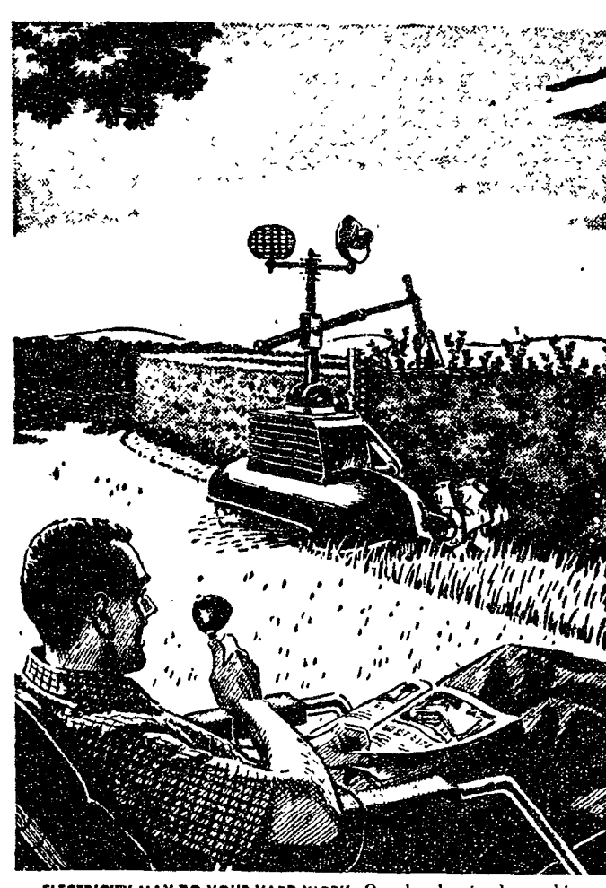
ELECTRICITY MAY DO YOUR YARD WORK. One day, by simply speaking into a microphone, you may be able to command an electric "gardener" to mow the grass, cultivate the flower beds, trim the hedge and do other yard work. And all the while you'll be relaxing in the shade,

Write Woodward Cave, Woodward, Pa. for brochures.