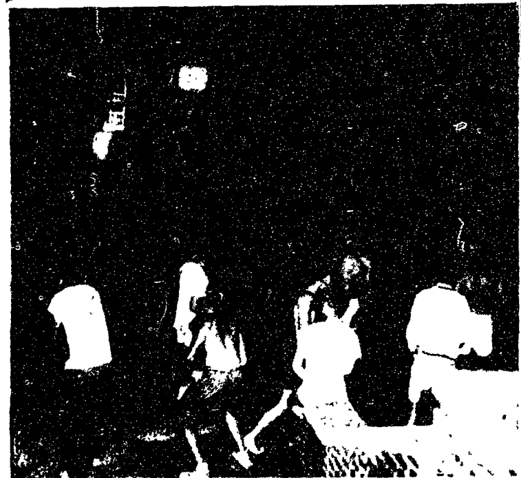
"TRY IT AGAIN, YOU CHICKENS"—were the cries from the courtyard gang in front of McKee Hall last night. The event was a full scale water battle that lasted from early yesterday morning until late last night.