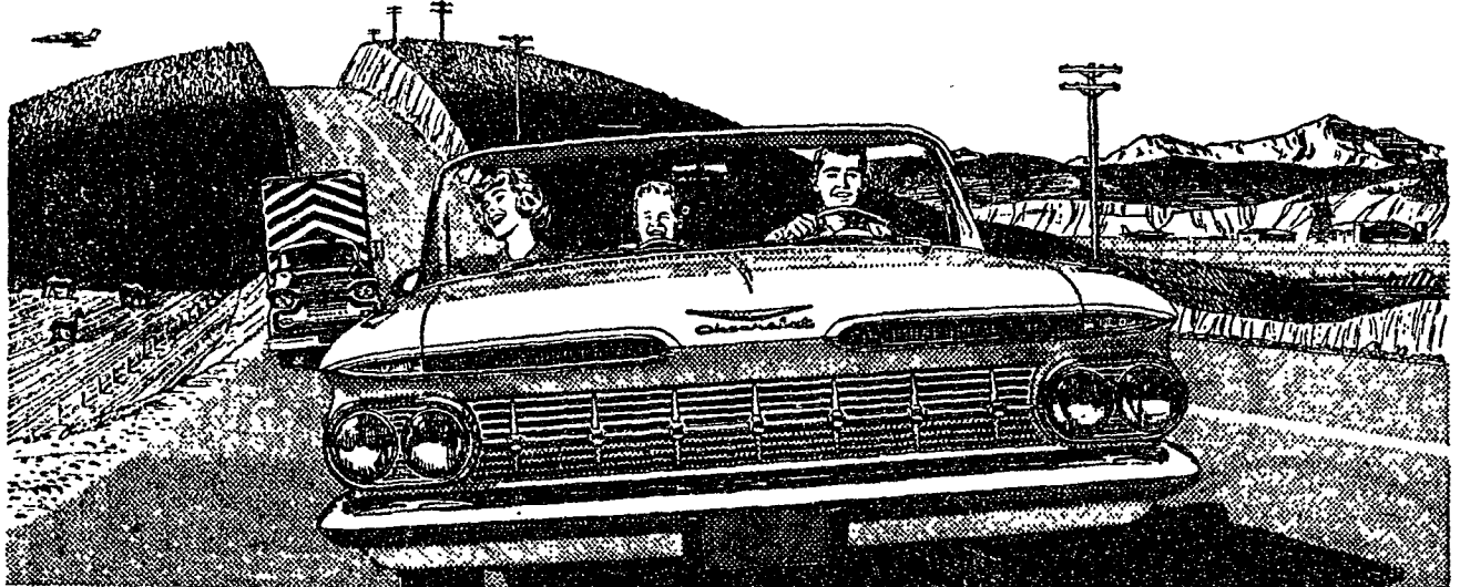
A V8-powered Impala Convertible . . . unmistakably '59!