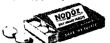
The safe stay awake tablet—available everywhere

P. S.: When you need NoDoz, it'll probably be late. Play safe. Keep a supply handy.