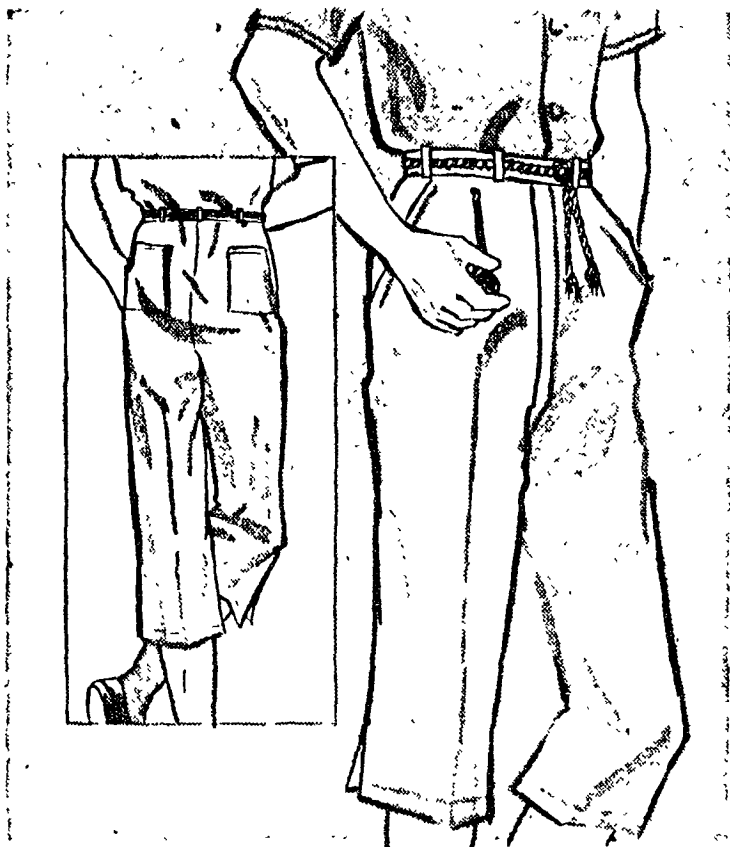
Men's Washable Sanforized Beach Comber Twill Pants

Featuring a New and Complete DOWNSTAIRS SALESFLOOR