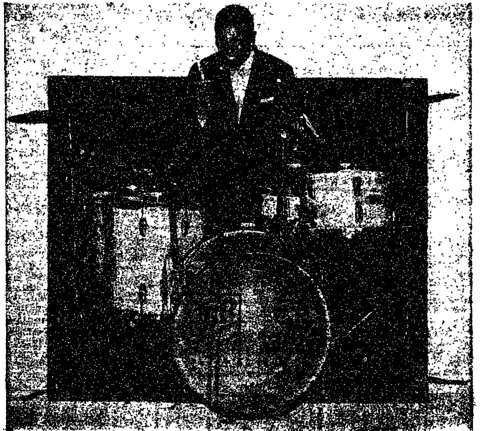
Buddy Rich and his Orchestra