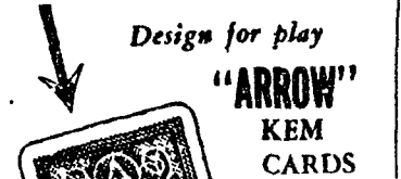
Design for play "ARROW" KEM CARDS