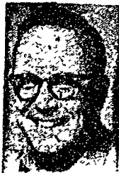
By JIM BATHURST

With all the new "additives" in gasoline, I expect every day to see alphabet soup come out of the hose nozzle.